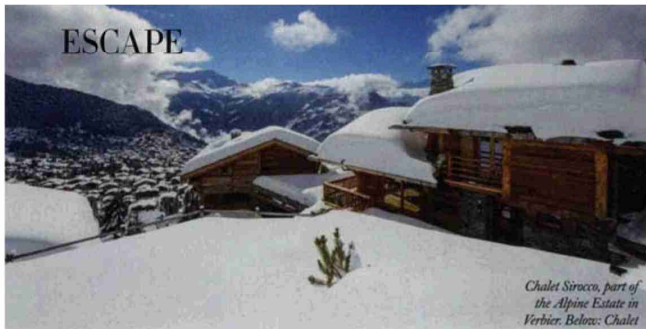
Chalet Sirocco, part of the Alpine Estate in Verbier. Below: Chalet Tosselen, on the same property. Bottom: Haus Alpina, Klosters

Client: Chalets Source: Harper's Bazaar (UK) (Main) Date: 01 January 2015 Page: 188 Reach: 108472 Size: 561cm2 Value: 17076.84